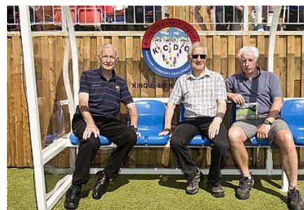
Handover of new dugout at the Dell.

The fund continues to accept applications of up to £2500 from organisations within PH21, with the application form available at: http://www.kcdc.co.uk so if you know of an organisation which would be assisted by an input from the fund, please make contact with any of the directors.