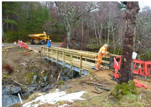
The replacement almost complete. February 2018