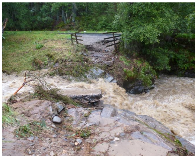
The site of the bridge on the morning of 11 th August 2014

awarded over £6000 from the Peoples' Postcode Trust and is currently one of the recipients of funding through Tesco's Bags for Help scheme, so please ensure that if you shop there you vote for the project in store at Aviemore over March and April.